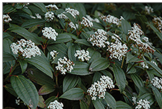
David Viburnum flowers

33 BARTLETT FARM ROAD NANTUCKET, MA 02554