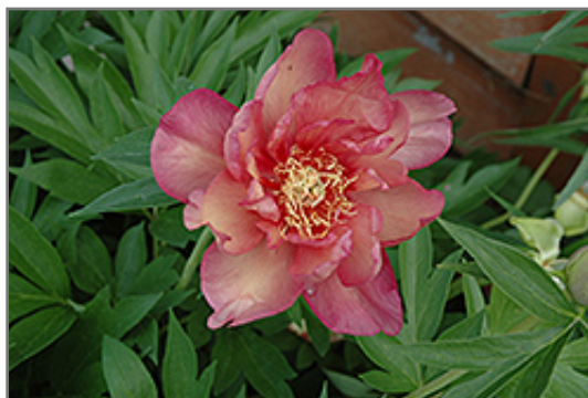
Kopper Kettle Peony flowers