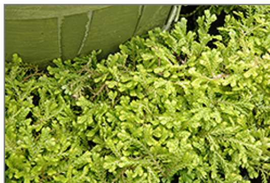
Golden Spikemoss foliage