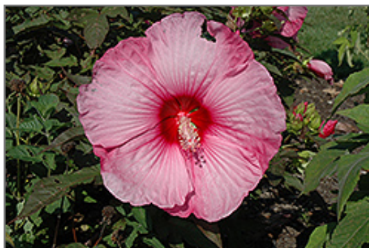
Stardust Hibiscus flowers

Other Names: Rose Mallow, Hardy Hibiscus