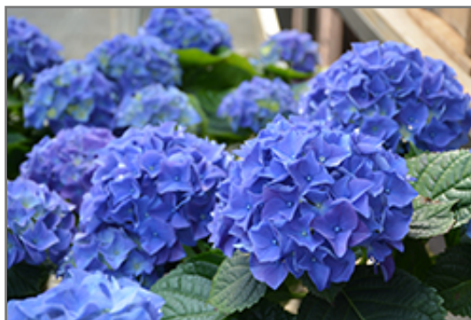
Early Blue Hydrangea flowers