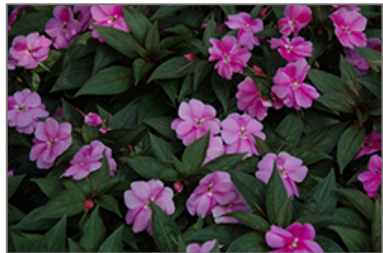
Divine Lavender New Guinea Impatiens flowers

33 BARTLETT FARM ROAD NANTUCKET, MA 02554