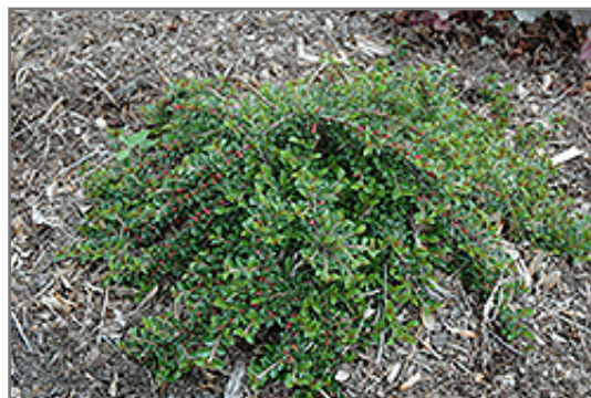
Little Gem Cotoneaster