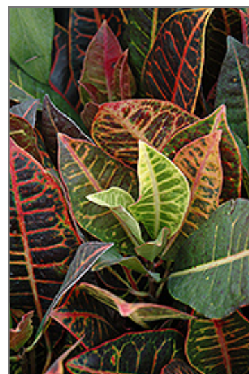
Variegated Croton foliage