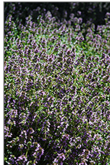
Lemon Thyme flowers

Lemon Thyme is smothered in stunning spikes of lilac purple flowers rising above the foliage from early to late summer. Its attractive tiny fragrant round leaves remain light green in color throughout the year.