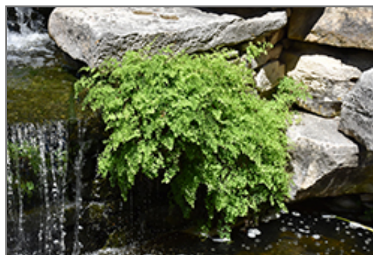
Southern Maidenhair Fern