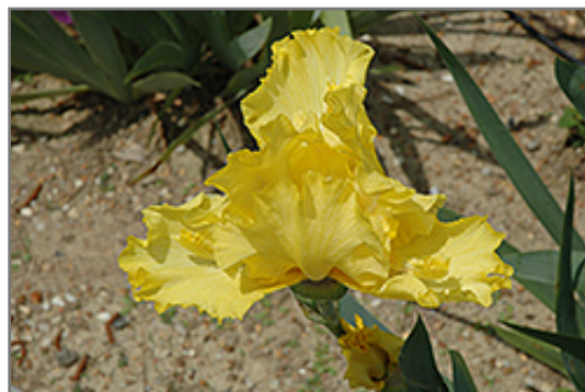
Double Trouble Iris flowers