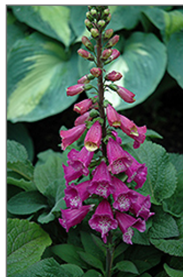
Candy Mountain Foxglove flowers

Unique, upward facing flowers of violet-rose with white interiors and dark purple spots; tall spikes rise above attractive green oblong shaped leaves; a biennial that's happiest in part shade with adequate moisture