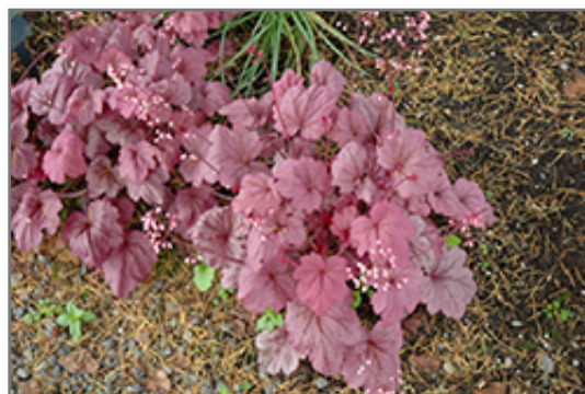
Georgia Plum Coral Bells