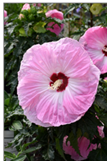
Tie Dye Hibiscus flowers