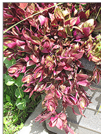
Purple Wandering Jew

Purple Wandering Jew is recommended for the following landscape applications;