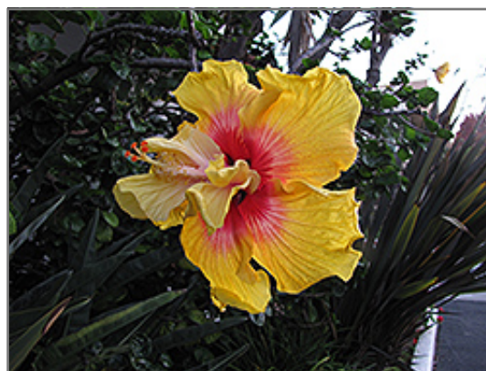
The Path Hibiscus flowers

This variety has a rounded upright shape bearing large, buttercup-yellow blooms with rose-pink streaks at the petal bases and red centers; makes an ideal hedge, screen, or background planting; great for containers; do not allow to dry to wilting point