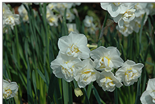
Cheerfulness Daffodil flowers