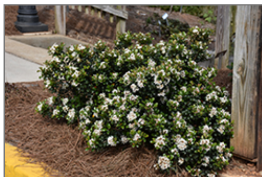
Southern Moon Yedda Hawthorn in bloom

Southern Moon Yedda Hawthorn is recommended for the following landscape applications;