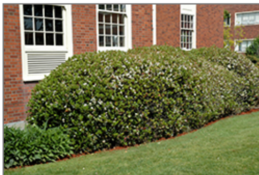
Southern Moon Yedda Hawthorn

This shrub does best in full sun to partial shade. It prefers to grow in average to moist conditions, and shouldn't be allowed to dry out. It is not particular as to soil type or pH. It is somewhat tolerant of urban pollution. This is a selected variety of a species not originally from North America.