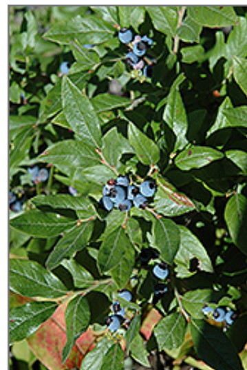
Lowbush Blueberry fruit

This is an open spreading deciduous shrub with a spreading, ground-hugging habit of growth. Its relatively fine texture sets it apart from other landscape plants with less refined foliage. This is a relatively low maintenance plant, and usually looks its best without pruning, although it will tolerate pruning. It is a good choice for attracting birds to your yard. It has no significant negative characteristics.