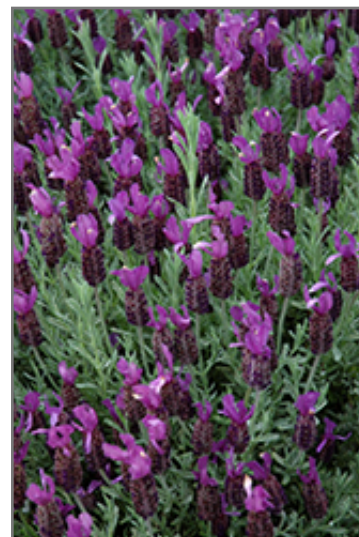
Anouk Supreme Spanish Lavender flowers

Anouk Supreme Spanish Lavender is recommended for the following landscape applications;