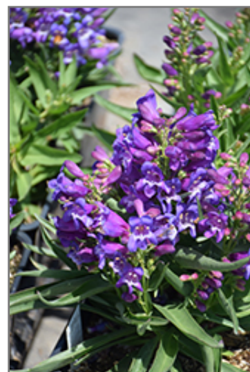
Rock Candy Blue Beard Tongue flowers