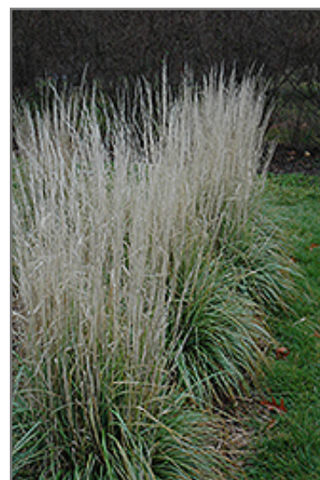
Avalanche Reed Grass in fall

Avalanche Reed Grass is recommended for the following landscape applications;