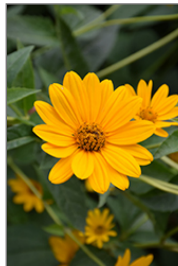
False Sunflower flowers

False Sunflower is recommended for the following landscape applications;