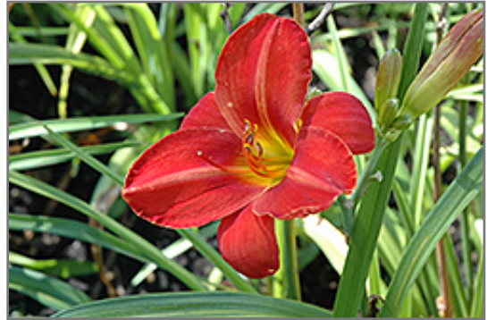
Apple Tart Daylily flowers

Ruby red flowers with bright yellow centers stand tall above arching green foliage; heat and drought tolerant; low maintenance; excellent for rock gardens, perennial borders or containers