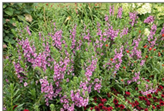
Angelface Super Pink Angelonia in bloom