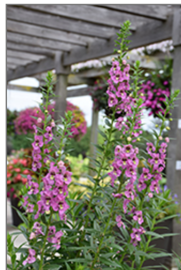
Angelface Super Pink Angelonia flowers