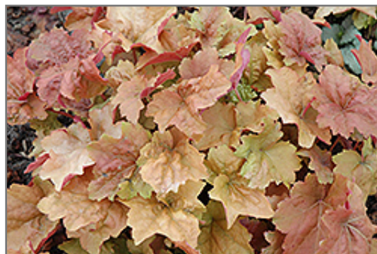
Dolce Creme Brulee Coral Bells foliage

Dolce Creme Brulee Coral Bells is recommended for the following landscape applications;