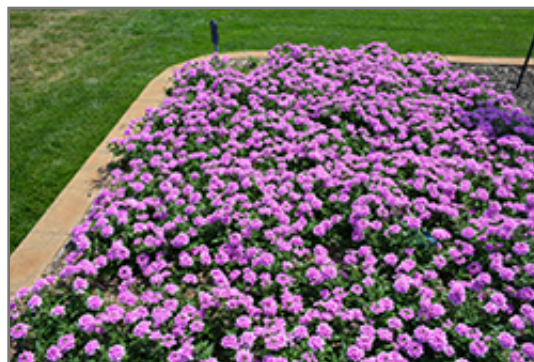
EnduraScape Pink Bicolor Verbena in bloom

EnduraScape Pink Bicolor Verbena will grow to be about 12 inches tall at maturity, with a spread of 24 inches. When grown in masses or used as a bedding plant, individual plants should be spaced approximately 18 inches apart. Its foliage tends to remain dense right to the ground, not requiring facer plants in front. It grows at a fast rate, and under ideal conditions can be expected to live for approximately 3 years. As an herbaceous perennial, this plant will usually die back to the crown each winter, and will regrow from the base each spring. Be careful not to disturb the crown in late winter when it may not be readily seen!