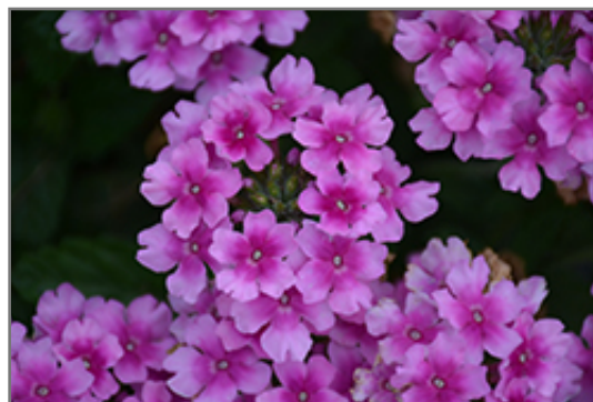
EnduraScape Pink Bicolor Verbena flowers

This plant will require occasional maintenance and upkeep. Trim off the flower heads after they fade and die to encourage more blooms late into the season. Deer don't particularly care for this plant and will usually leave it alone in favor of tastier treats. It has no significant negative characteristics.