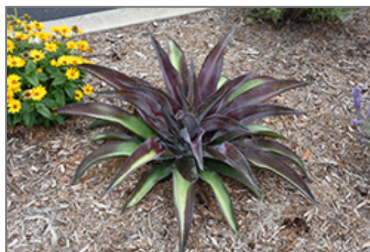
Mission to Mars Mangave

Mission to Mars Mangave is recommended for the following landscape applications;