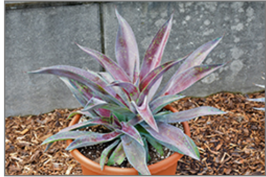
Mission to Mars Mangave

Mission to Mars Mangave will grow to be about 10 inches tall at maturity, with a spread of 22 inches. It grows at a fast rate, and under ideal conditions can be expected to live for approximately 5 years. As an herbaceous perennial, this plant will usually die back to the crown each winter, and will regrow from the base each spring. Be careful not to disturb the crown in late winter when it may not be readily seen!