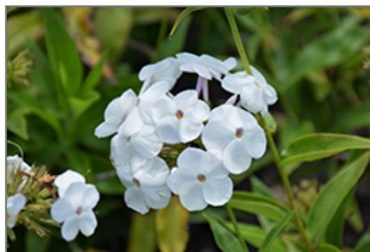
Opening Act White Phlox flowers