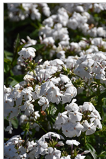
Opening Act White Phlox flowers

Opening Act White Phlox is recommended for the following landscape applications;