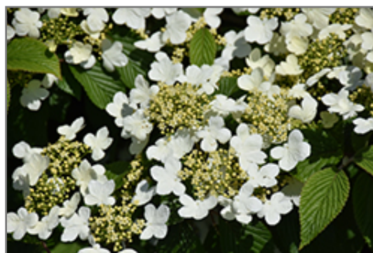
Wabi Sabi Doublefile Viburnum flowers

Wabi Sabi Doublefile Viburnum is a multi-stemmed deciduous shrub with a stunning habit of growth which features almost oriental horizontally-tiered branches. Its average texture blends into the landscape, but can be balanced by one or two finer or coarser trees or shrubs for an effective composition.