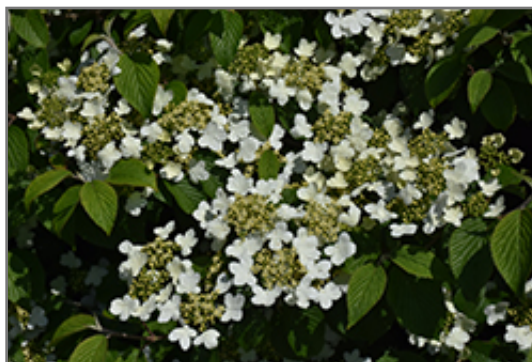
Wabi Sabi Doublefile Viburnum flowers