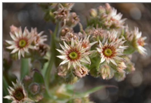
Black Hens And Chicks flowers