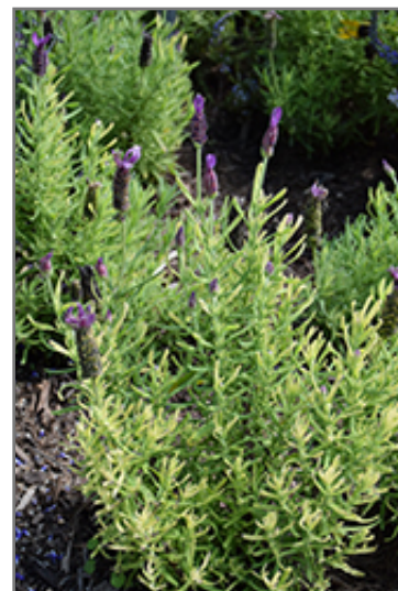
Javelin Forte Deep Purple Lavender in bloom

Javelin Forte Deep Purple Lavender makes a fine choice for the outdoor landscape, but it is also well-suited for use in outdoor pots and containers. It is often used as a 'filler' in the 'spiller-thriller-filler' container combination, providing a mass of flowers and foliage against which the thriller plants stand out. Note that when grown in a container, it may not perform exactly as indicated on the tag - this is to be expected. Also note that when growing plants in outdoor containers and baskets, they may require more frequent waterings than they would in the yard or garden.