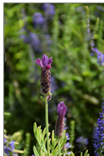
Javelin Forte Deep Purple Lavender flowers