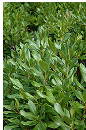
Northern Bayberry foliage