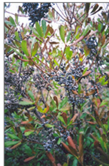
Northern Bayberry fruit

This shrub does best in full sun to partial shade. It does best in average to evenly moist conditions, but will not tolerate standing water. It is very fussy about its soil conditions and must have sandy, acidic soils to ensure success, and is subject to chlorosis (yellowing) of the foliage in alkaline soils, and is able to handle environmental salt. It is highly tolerant of urban pollution and will even thrive in inner city environments. This species is native to parts of North America.