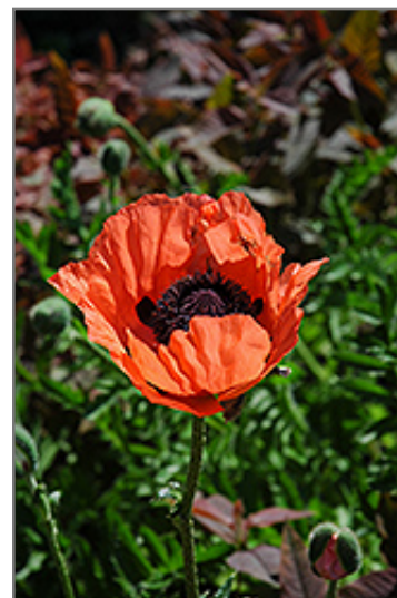
Carneum Poppy flowers

Carneum Poppy features bold salmon round flowers with burgundy eyes and black centers at the ends of the stems from early to mid summer. The flowers are excellent for cutting. Its deeply cut ferny leaves remain forest green in color throughout the season.