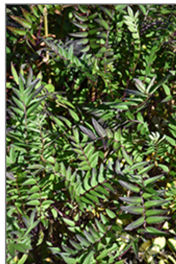
Bressingham Purple Jacob's Ladder foliage