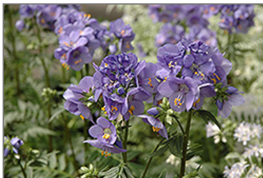
Bressingham Purple Jacob's Ladder flowers