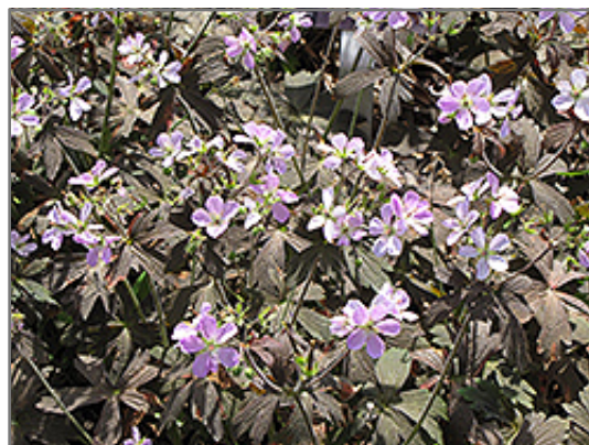
Espresso Cranesbill flowers