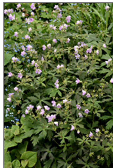
Espresso Cranesbill in bloom

Espresso Cranesbill will grow to be about 18 inches tall at maturity, with a spread of 24 inches. When grown in masses or used as a bedding plant, individual plants should be spaced approximately 20 inches apart. Its foliage tends to remain dense right to the ground, not requiring facer plants in front. It grows at a medium rate, and under ideal conditions can be expected to live for approximately 10 years. As an herbaceous perennial, this plant will usually die back to the crown each winter, and will regrow from the base each spring. Be careful not to disturb the crown in late winter when it may not be readily seen!