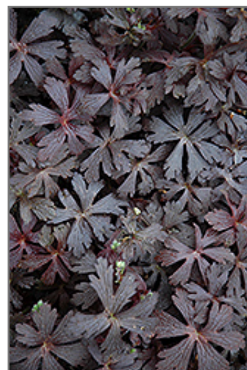
Espresso Cranesbill foliage