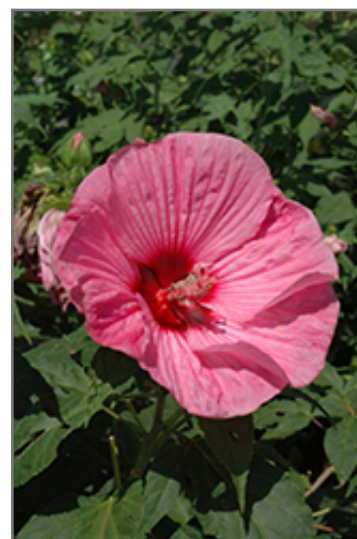
Plum Crazy Hibiscus flowers

This bold garden perennial features showy ruffled, lavender-pink flowers w/dark-red eye; attractive, glossy, large, dark-green/bronze leaves; ideal for the mixed garden border or in mass; do not allow to dry to wilting point