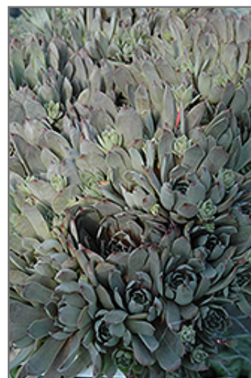
Big Blue Hens And Chicks

Big Blue Hens And Chicks is recommended for the following landscape applications;