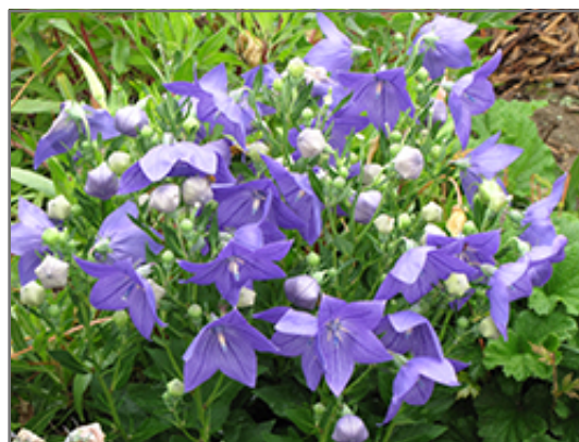
Sentimental Blue Balloon Flower in bloom

33 BARTLETT FARM ROAD NANTUCKET, MA 02554