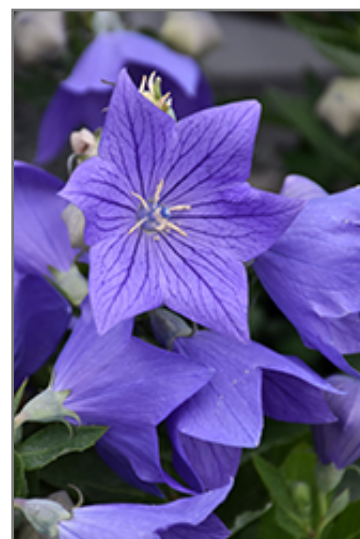
Sentimental Blue Balloon Flower flowers

Sentimental Blue Balloon Flower is recommended for the following landscape applications;