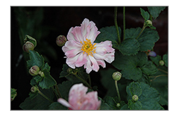
Queen Charlotte Anemone flowers

33 BARTLETT FARM ROAD NANTUCKET, MA 02554 Phone: (508) 228-9403 Fax: (508) 228-5340 bartlettsfarm.com