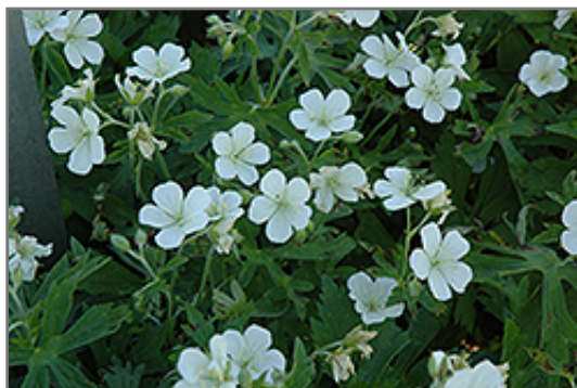
White European Wood Cranesbill flowers