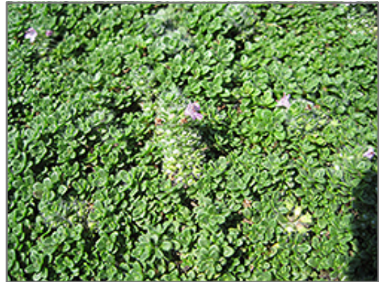
Elfin Creeping Thyme in bloom

This plant will require occasional maintenance and upkeep, and is best cleaned up in early spring before it resumes active growth for the season. Deer don't particularly care for this plant and will usually leave it alone in favor of tastier treats. Gardeners should be aware of the following characteristic(s) that may warrant special consideration;