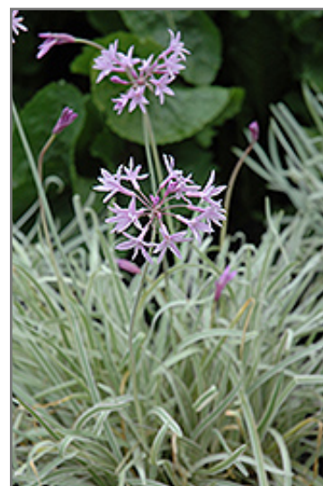
Tricolor Variegated Society Garlic flowers

This is an herbaceous perennial herb with a mounded form. Its medium texture blends into the garden, but can always be balanced by a couple of finer or coarser plants for an effective composition. This is a relatively low maintenance plant, and should be cut back in late fall in preparation for winter. It has no significant negative characteristics.