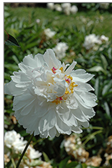
Boule de Neige Peony flowers