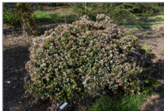
Eleanor Taber Indian Hawthorn in bloom

Eleanor Taber Indian Hawthorn is recommended for the following landscape applications;